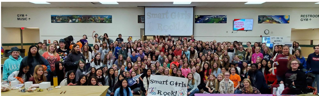
Smart Girls Rock attendees: 237 6th through 8th graders

Smart Girls Rock! took place at Menomonie Middle School on Wednesday, November 8, 2023. Smart Girls Rock! is a STEAM (Science, Technology, Engineering, Arts, and Mathematics) event meant to spark interest in STEAM careers among middle school girls. In its seventh year, 237 sixth through eighth-grade girls were able to meet 47 women in various STEAM careers in an open-house format to explore 22 stations. This year it showcased women professionals from 3M, Anderson Windows, Mayo Clinic Physical Therapy and Rehabilitation, Hoof and Paw Veterinary Clinic, Phillips Medsize, Gibson Aviation, Eau Claire 4-H, SDMA Tech, Agsource, Big Dot of Happiness, and UW-Stout: Psychology, Industrial Design, Nutrition&Dietetics, IT, Packaging, Craft Artist. As well as women in the careers of biomedical engineering, packaging, quality technician, engineering, and manufacturing.