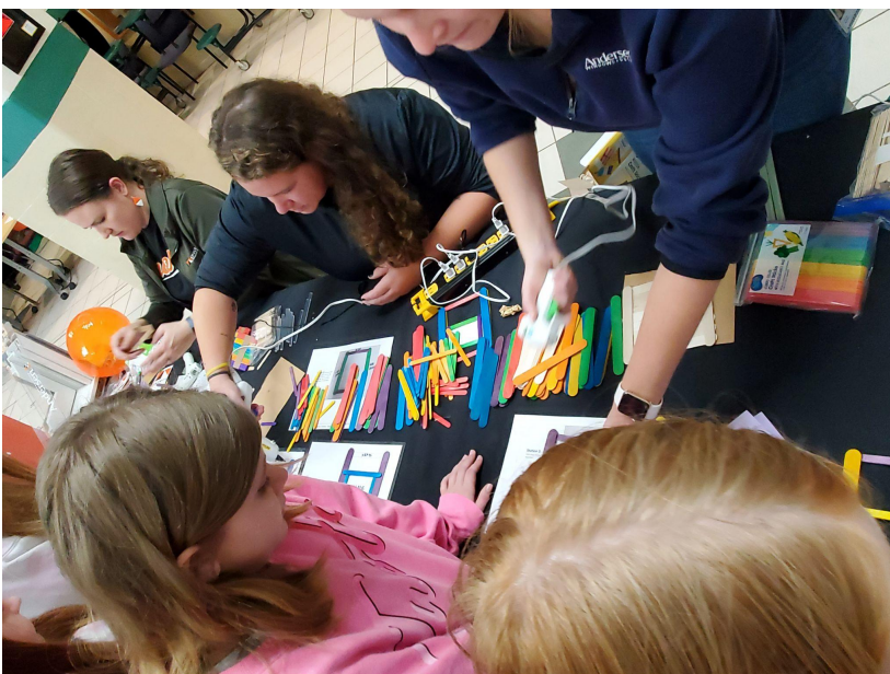
The girls got to make their own window out of popsicle sticks at the Anderson Windows table.