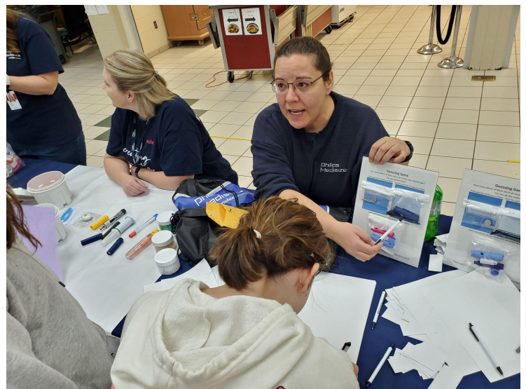
Phillips Medsize showed the girls examples of resin that goes into insulin.